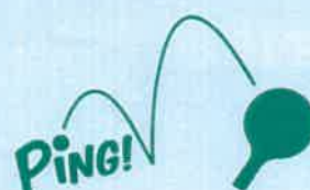
Table Tennis Challenge