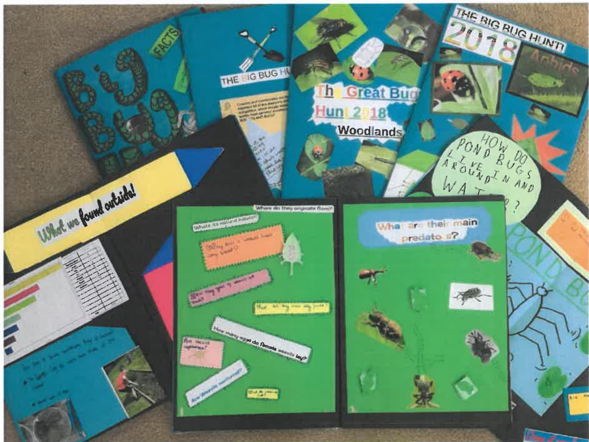
Little Melton Primary School

First prize of an "insect day" at the school goes to Little Melton Primary School in Norwich.