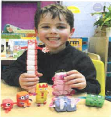
Oscar's amazing Number blocks

I hope you all have an enjoyable half-term week.