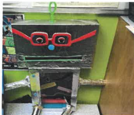
Molly B. made a superb robot