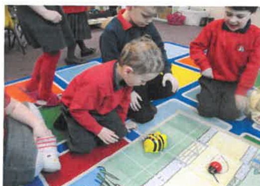
Stay and Play Ladybirds