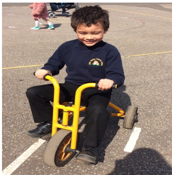
Enjoying the Tricycles!