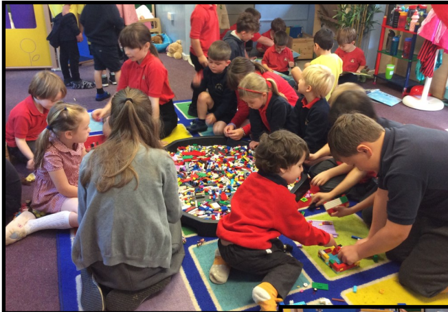
Buddies working together

Next week we are delighted to see that competitive inter-school sports are now back again after the interruptions of the last eighteen months. Eagle Owls children will be participating in a football league tournament over a sequence of Monday evenings at the UEA– good luck to both our teams– and the older children in Barn and Eagle have also been preparing well for the forthcoming school cross-country event, also to be held at the UEA later this term. Another welcome return of relative normality and opportunity for the children.