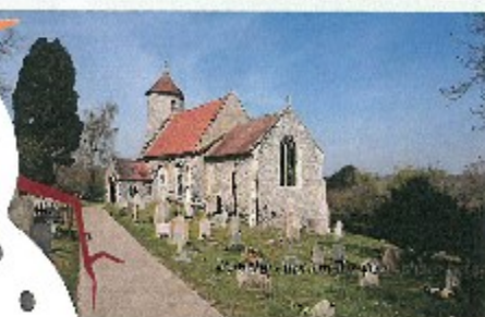
In Support of Friends of Bawburgh Church