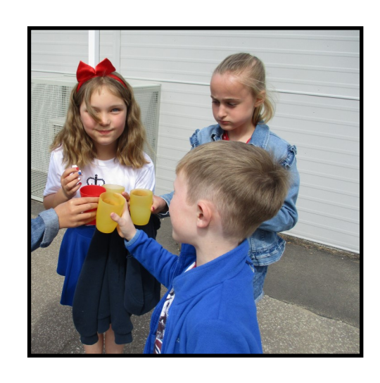
Queen's Jubilee Celebrations, Friday May 25th, 2022