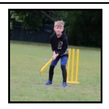
Year 5/6 Dynamo's Cricket Competition, May 23rd, 2022