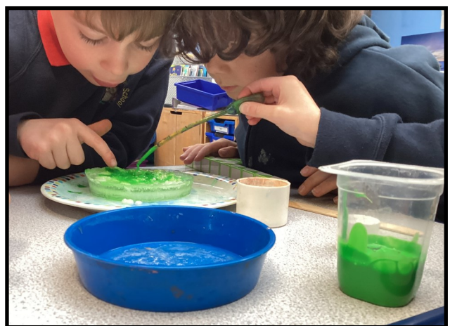
Year 2 Ice Experiment

I'm sure that she will have a happy and successful time with us at Little Melton.