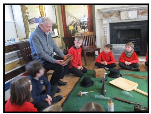
Barn Owls Norwich Museums Visit March 2023