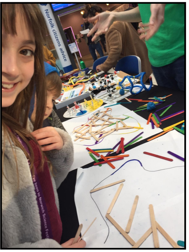
Norwich Science Festival February 2023