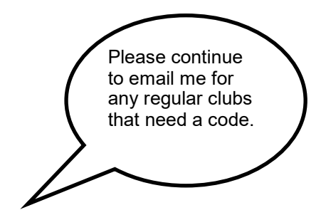
Some useful codes: